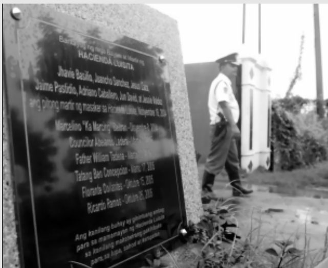
Memorial to Hacienda Luisita dead

To date, the investigations into these killings have not led to any conclusive results or any perpetrators being identified or prosecuted, despite there being a large number of persons who witnessed the attacks.